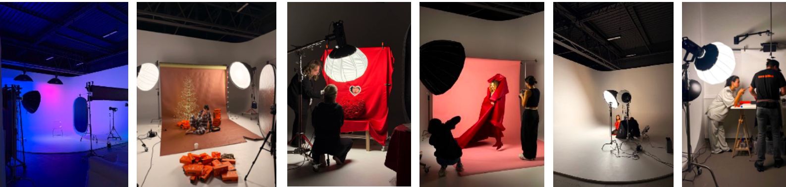
PHOTO & VIDEO STUDIO

PROFESSIONAL PHOTO & VIDEO STUDIO WITH ARTIFICIAL LIGHTING (NO NATURAL DAYLIGHT). FEATURING A CYCLORAMA (6 × 7 M) AND A PRODUCT PHOTOGRAPHY ZONE. TOTAL STUDIO AREA IS 81 M 2